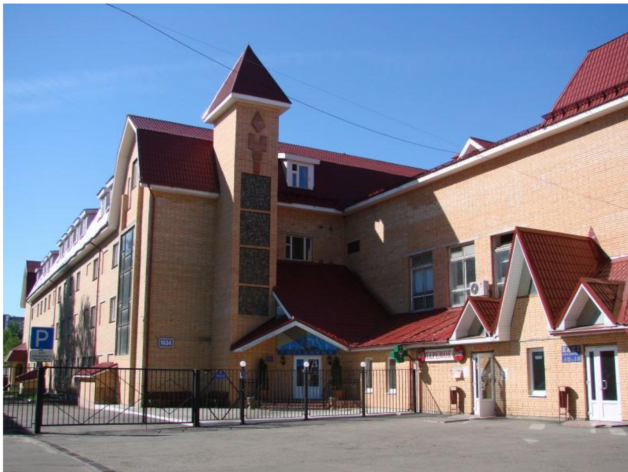
The view of Record Hotel